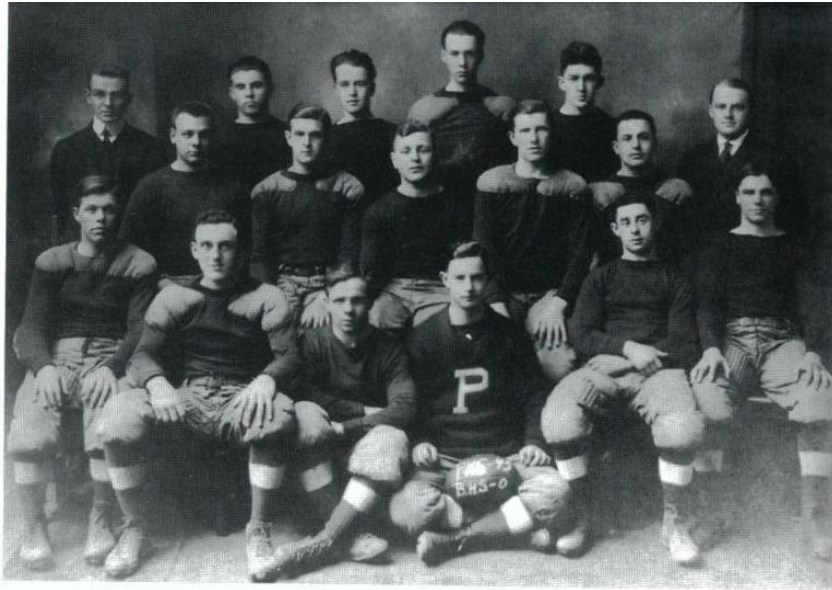
Fig. 1. Portland High School 1913 State Champion's football team of which Ford was the star fullback [pictured on the far right of the back row].(source: Joseph McBride, Searching for John Ford [St. Martin's Press, 2001]). Photo reprinted with the permission of Portland Public Schools, Portland Maine (USA))