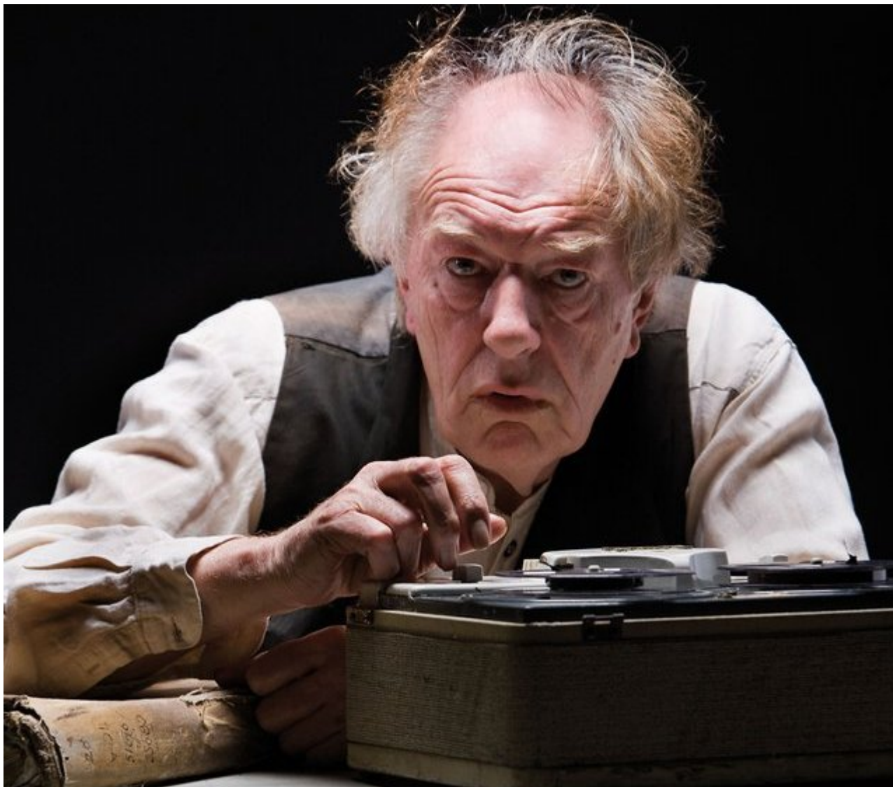
Michael Gambon as Krapp in the Gate Theatre production of 'Krapp's Last Tape' by Samuel Beckett.