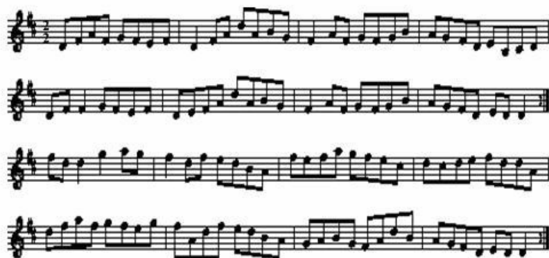
Fig. 3, "Dowd's No. 9" 176

bars, occasionally with an introduction. After each group of four bars, there is typically a return to the initial motif of the first bar, with some variation, before the entire section is repeated at the end of the eighth bar, before moving to the next section. Fig. 3 below features an example of the reel "Dowd's No. 9" which Carson discusses in Last Night's Fun :