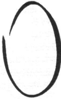
Fig. 1 127

Indeed, a broken egg is the theme of the first poem of this collection, "Hen Woman". This broken "ouroboros" may well refer to a persistent concern within modern Irish poetry, a concern with the fractured nature of the Irish tradition which Kinsella has outlined at length in The Dual Tradition . Following his encounter with traditional singing, and his long friendship with Seán Ó Riada, who has also used the image of the ouroboros to describe traditional music and song, Kinsella would subsequently incorporate aspects of Gaelic literature into his poetry, as he engaged with his fractured literary "inheritance [...] across a century's silence, and through the exchange of worlds", 128 reflected in the gapped "ouroboros".