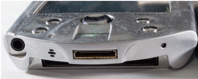
Fig. 2. A close-up of the swipe fingerprint sensor (below the main central button) on an older IPaq handheld computer.

Fingerprint technology was featured on other consumer devices, including smartphones, but it was not until the introduction of Touch ID™ in 2013 that fingerprint recognition really came into mainstream consumer use. The Touch ID™ sensor uses capacitive touch to detect the user’s fingerprint and has 500 pixels per inch resolution. The fingerprint can be read in any orientation – an important feature for consumer applications. It is closely integrated into the iOS operating system and the user’s fingerprint can unlock the device and in addition authenticate purchases of digital media. The fingerprint data is stored locally rather than in a central database – an important point that will be discussed later.