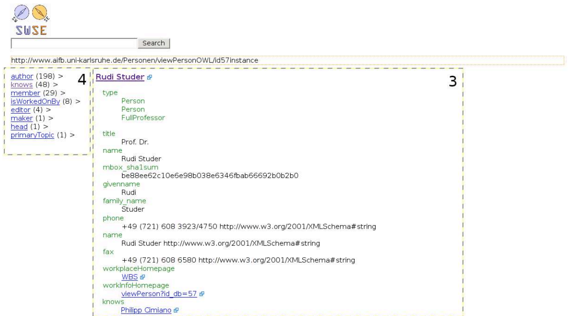
Fig. 2. Entity page containing information about Rudi aggregated from multiple sources.

incoming relations to the focus instance in a column on the left side of the pane (4). Users are shown that Rudi has authored 198 papers, that 48 people know him, that he is the maker of a file and editor of four things.