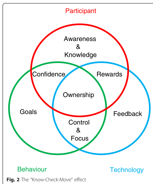
Fig. 2 The “Know-Check-Move” effect