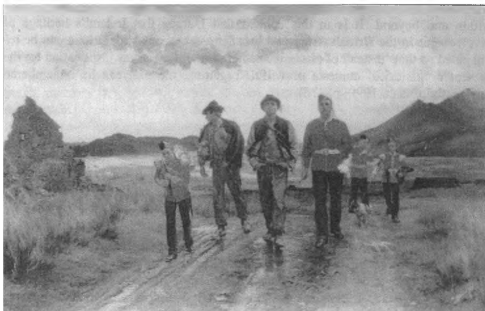
Figure 3.1 'Listed for the Connaught Rangers' (1878) by Lady Butler