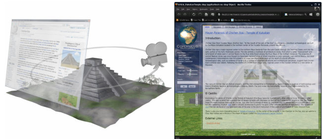
Figure 1. The idea behind 2LIP.

Bolter's vision inspired our team as well. We work on a new way for designing interactive 3D web applications – 2-Layer Interface Paradigm (2LIP) [10]. 2LIP is an attempt to marry advantages of 3D experience with the advantages of the narrative structure of hypertext. It assumes that building graphical user interfaces involves the integration of two layers (see Figure 1): (1) the background layer is a 3D scene; (2) the foreground layer, above the 3D view is the hypertextual content, together with graphics, and multimedia (e.g., videos or other interactive 3D scenes). Hyperlinks are used for navigation in the 3D scenes (in both layers).