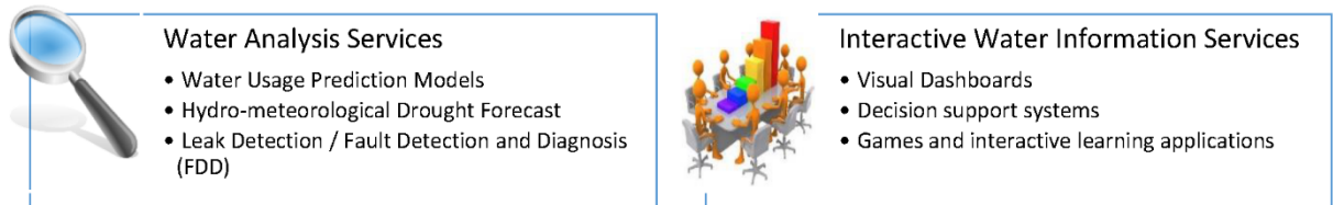
Fig. 2: WATERNOMICS applications

The WATERNOMICS platform forms the basis for the delivery of a number of key services, as outlined in the project objectives: