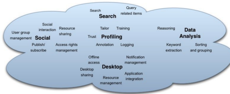
Fig. 1. Services of the Social Semantic Desktop.

Desktop focuses on services for the resource management . Resources can be created, modified, or viewed. They can be shared with other users and synchronized for offline working . For the data exchange between desktop applications NEPOMUK provides interfaces that enable services such as a Semantic Clipboard [7]. The SSD should further support desktop sharing for collaborative working on resources. NEPOMUK users can also define in their profile how they want to be informed about the occurrence of events ( e.g. , via email, instant messaging, or SMS).