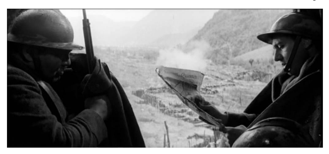
Figure 46: the soldiers at the front read a magazine article about the cease fire, from the same film