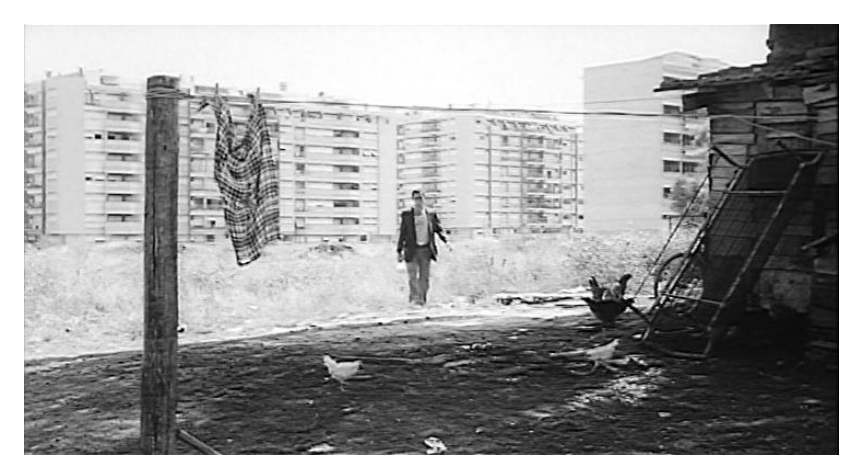
Figure 22: a poor man (Vittorio Gassman) returns to the shed in which he lives from Che Vitaccia! , the seventh episode of I Mostri (Dino Risi, 1963)

The episode alludes to the fact that the consumerist goods that the Economic Miracle offers have become a priority, coming even before the goods necessary for everyday survival. As the reference to the neorealist post-war unemployment setting implies, even the poor have been embedded in the new socio-economic order. Gassman's over-acting the part of the unfortunate poor man suggests that the filmmakers are actually parodying neorealism with Che Vitaccia! , the exaggerated accents used in this depiction of poverty being almost a caricature of a neorealist trademark. <sup>41</sup>