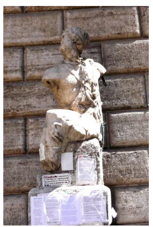
Figure 48: the statue of Pasquino in present day Rome