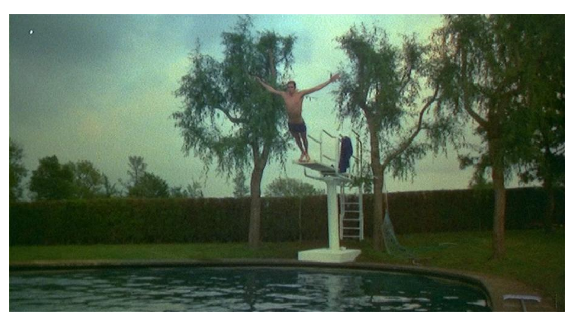
Figure 40: Gianni's (Vittorio Gassman) is freeze-framed at the start of the film C'eravamo Tanto Amati (Ettore Scola, 1974)