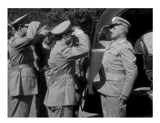
Figures 7 and 8: the peasants of Saliena engage in the most popular hobby, spying on Marshal Carotenuto (Vittorio De Sica) in Pane, Amore e Fantasia (Luigi Comencini, 1953)