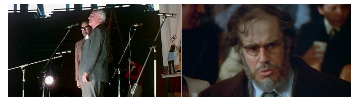
Figure 38: De Sica plays himself at a political rally in C'eravamo Tanto Amati (Ettore Scola, 1974)

Chapter Three: Satirising the Present and Mythicising the Past. Comedy Italian Style's Dual Approach Towards Social Reality and Its Neorealist Roots