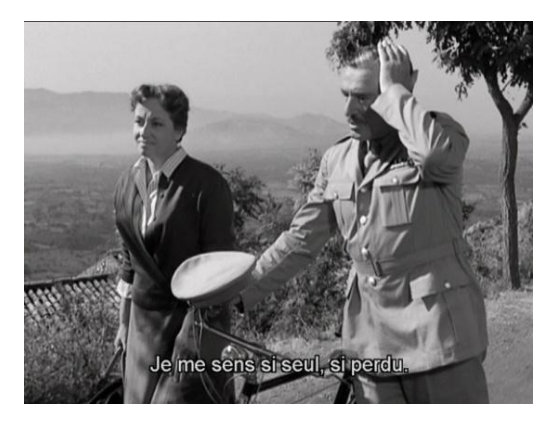
Figures 9 and 10: Marshal Carotenuto's encounters with la Bersagliera (Gina Lollobrigida) inspire him to court the village midwife (Marisa Merlini) in the same film