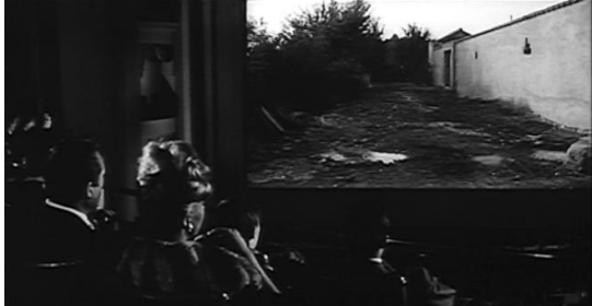
Figure 25: a German soldier drives his Figure 26: the war setting is revealed to Motorcycle towards a villa in Scenda l'Oblio, an episode from I Mostri (Dino class couple in a movie-theatre during Risi, 1963)