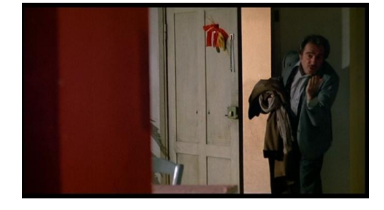
Figure 13: Lello Mascetti (Ugo Tognazzi) leaves the family house with an excuse in the same film