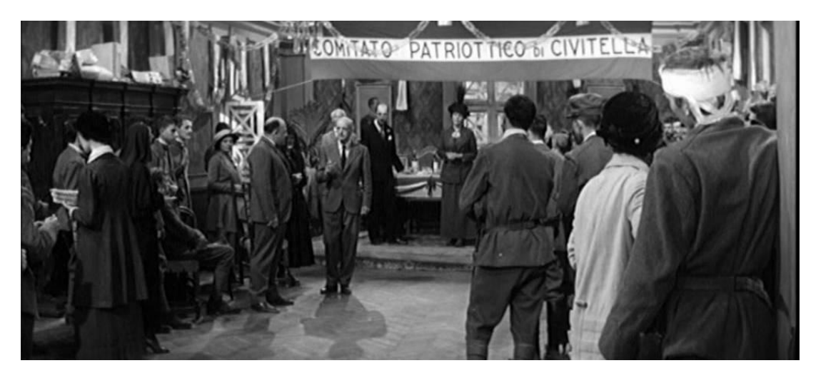
Figure 45: the regiment attends a rally in a nearby village in La Grande Guerra (Mario Monicelli, 1959)

in the Italy of the early 1960s, the historical " filone " of comedy Italian style (not only Monicelli's) has indeed played a social role: that of giving to the popular urbanised masses a modern historical knowledge, and most of all that of giving them the consciousness of having been active subjects (as much as vexed ones) of Italy's history (174). <sup>51</sup>