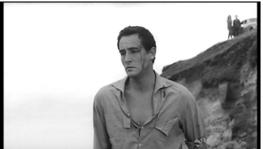
Figure 16: Bruno Cortona's iconic car crashes at the bottom of a cliff, killing Roberto Mariani in Il Sorpasso (Dino Risi, 1962)