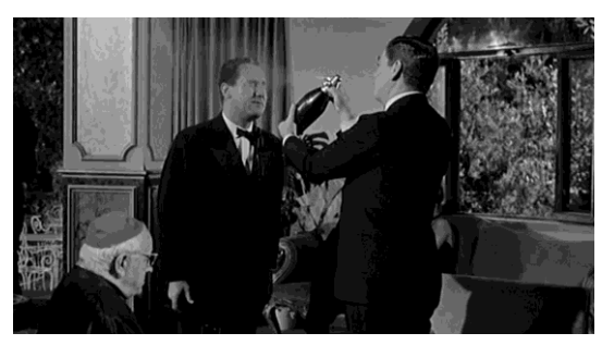
Figure 34: Silvio (Alberto Sordi) is humiliated by his employer Bracci (Claudio Gora) in Una Vita Difficile (Dino Risi, 1962)

possible in the Italy of 1961? The open-ended aspect of Risi's film in relation to these central questions it posed very much mirrors the question Ladri di Biciclette purposely renounced answering: will Antonio Ricci be able to feed his family without a bicycle in 1948 Rome? In this respect Una Vita Difficile displays the same "openness" feaured in the Italian art cinema representations of the Economic Miracle, such as Antonioni's La Notte , which were always recognised to be indebted to the neorealist tradition, whereas comedy Italian style was not.