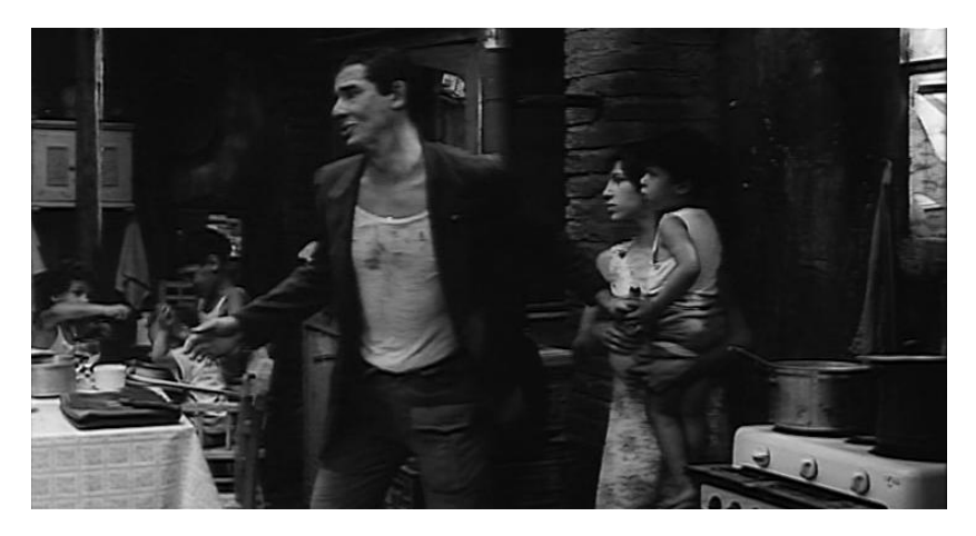
Figure 23: the man worries about his starving family, from the same film