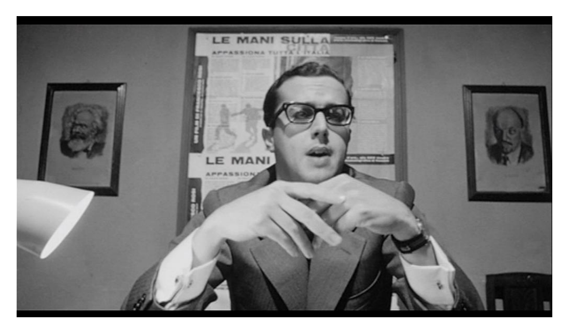
Figure 27: a P.C.I. bureaucrat channels Aristarco's view on the 'crisis' of neorealism in La Vita Agra (Carlo Lizzani, 1965)

What the filmmakers imply with this added layer of narrative inserted in their screen version is that even a determined and cultured man is inevitably assimilated by the spiral of consumerism and integrated in the Economic Miracle élite. Their alteration of the original text is thus motivated by the articulation of the social reality they represent on screen through a paradox that mirrors the post-war neorealist films with a contemporary setting.