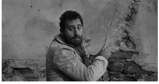
iron in Una Vita Difficile (Risi, 1962)