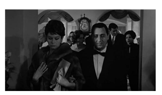
Figure 36: Silvio and Elena walk away Figure 37: Antonio Ricci (Lamberto from the Economic Miracle in Una Vita Maggiorani) and his son Bruno (Enzo Difficile (Dino Risi, 1962) Staiola) walk away from the Stadio