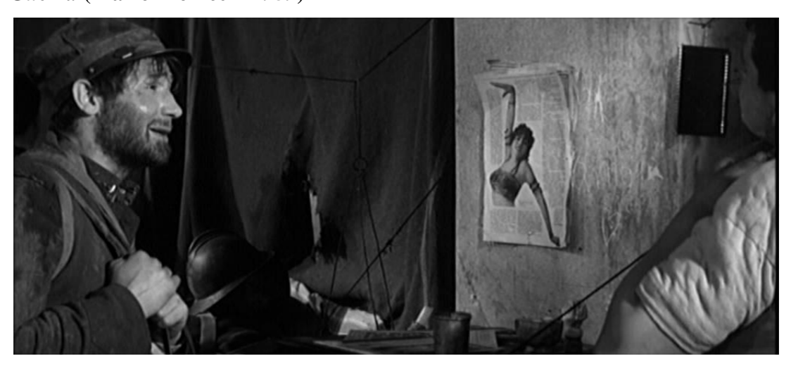
Figure 44: two soldiers from different regional backgrounds discuss he beauty of Italian silent film star Francesca Bertini, in the same film.

Whereas the soldiers' lingo reveals their regional differences through their accents, the army officers in charge command their orders in formal Italian, thus revealing an upper-class upbringing. However, when Busacca repeatedly disobeys his Sergeant's orders, the infuriated officer addresses him in Piemontese dialect. This dialectal choice signals how Gramsci's conception of the Risorgimento as a war of expansion led by the Piedmontese House of Savoy, which on the eve of the 1960s, when the film was made, was circulating due to the dissemination of the Prison Notebooks , for the first time had come to inform a comedic film. <sup>40</sup> The filmmakers'