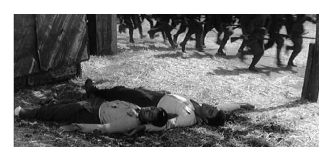
Figure 29: soldiers Jacovacci (Alberto Sordi) and Busacca (Vittorio Gassman) get the same fate in La Grande Guerra (Monicelli, 1959)