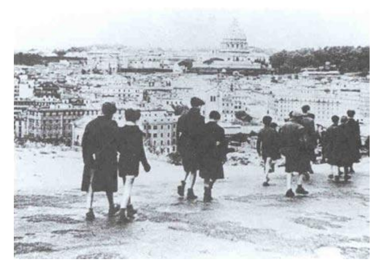
Figure 20: the children walk back towards Rome after the execution of Don Pietro in Roma Città Aperta (Roberto Rossellini 1945)

David Forgacs agrees with this point of view, pointing out that Rossellini's film "involves the working up of certain pieces of raw material into a selective myth or legend to the exclusion of other memories: those, notably, of political divisions among Italians, guilt over non-resistance, cowardice or collusion" ( Space, Rhetoric and the Divided City 109). This ethical reading of the Resistance characterised simply as a struggle between 'good' and 'evil' is confirmed in the last shot of the film, showing the group of children who witnessed the execution of Don Pietro marching back towards the city with Saint Peter's dome towering in the background. [figure 20]. Overall the neorealist films set during the Resistance express the ethical rhetoric of freedom pursued at any cost through Resistance fighting, with the Americans represented as liberators but at the same time highlighting that the communication between Italian partisans and Allied soldiers is somewhat problematic, as is the case in Rossellini's following neorealist film Paisà (1946).