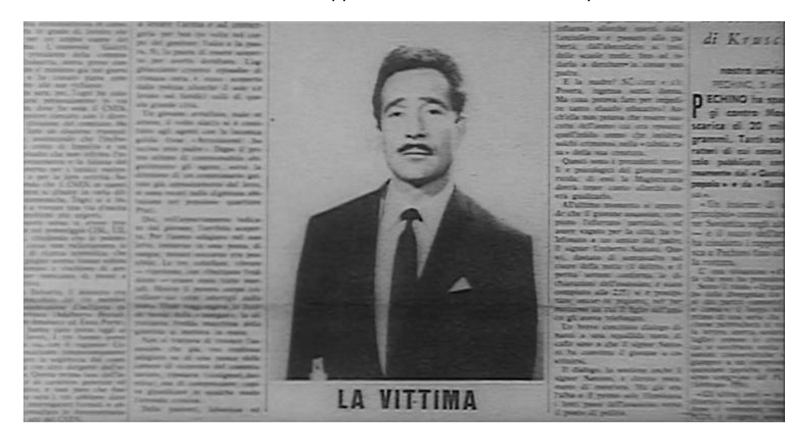
Figure 21: a newspaper story covers the murder of a father (Ugo Tognazzi) by the hand of his own son in L'Educazione Sentimentale , the opening episode of I Mostri (Dino Risi, 1963)

Two episodes in Risi's film refer to neorealist signature landscapes and are further indicative of the comedy Italian style filmmakers' positions towards the current socio-political landscape. In the first one, entitled Che Vitaccia!, a ragged man (Vittorio Gassman) walks towards a wooden shed that is falling apart. The high multi-storey buildings in the background confirm that the episode is set during the Economic Miracle. [figure 22] However, when the man walks in the shed, we find out that his numerous family lives in it. This setting amongst the poor reminds us of neorealist films concerning post-war unemployment. [figure 23] A doctor is examining one of the man's children, who is sick. Throughout the examination Gassman's character keeps complaining about his misfortunes and about the family's limited budget. "The milkman will not add to our tab anymore!" <sup>38</sup> – he explains and when he is told by the doctor that his son may need some antibiotics, he sarcastically asks his wife (Angela Portaluri): "What are we going to eat tomorrow? Medicines?" <sup>39</sup> However, throughout the scene, the conversation between the man and his wife foregrounds the fact that there is somewhere the man must go and that paying the doctor for the call will not leave him enough money for this non-specified journey.