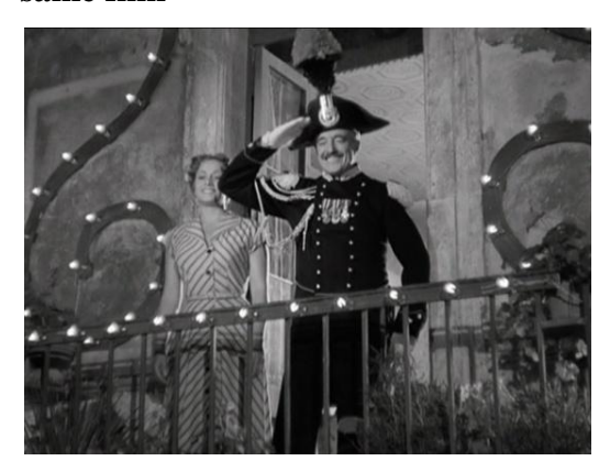
Figure 11: Marshal Carotenuto publicly declares his love for the midwife for the benefit of Saliena's gossiping citizen in the same film