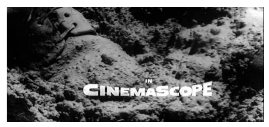
Figure 43: broken boots sink in the mud in the very first shot of La Grande Guerra (Mario Monicelli 1959)