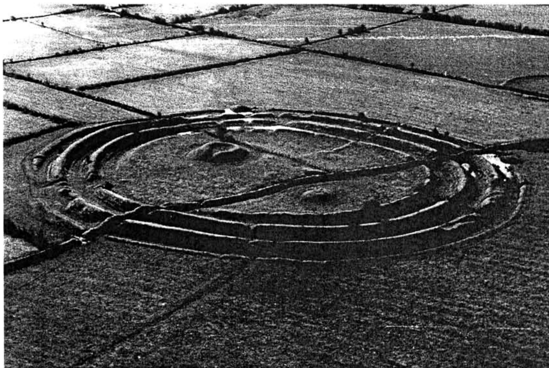
10.4 Rathra, Co. Roscommon: the larger of two mounds in the interior of this multivallate monument is close to the inner rampart and has a clearly visible penannular enclosure on its summit.