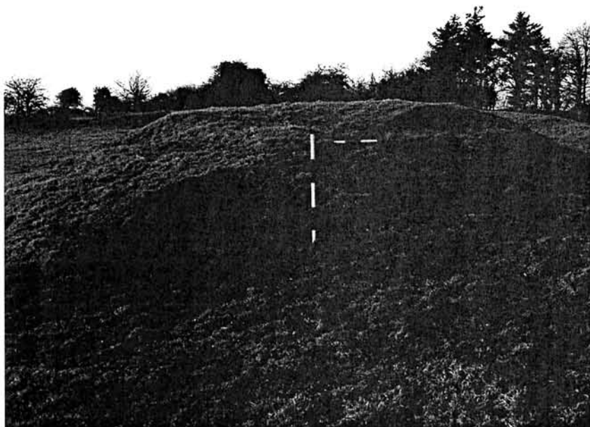
10.3 The mound within the ringfort at Rathbrennan, Co. Roscommon; the enclosure rampart is visible on the right. The penannular depression in the mound's summit is evident though slightly damaged by animal activity.