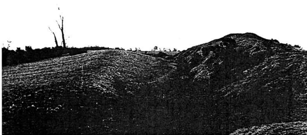
10.1 A photograph of the linear earthwork known as the Knockans, Teltown, Co. Meath, taken in 1939 and preserved in the photographic archives of the National Monuments Section, Department of Environment, Heritage and Local Government. The radiocarbon dates were obtained from the larger southern bank on the right of picture.

held during the festival of Lughnasad from at least as early as the sixth century. The assembly is not recorded throughout most of the tenth century and all of the eleventh but was briefly revived on two occasions in the twelfth. 18 Tailtiu has many legendary associations. It was here that the final battle between the sons of Míl and the Túatha Dé Danann took place. It also figures in early legend as the burial place of the mythical Tailtiu, wife of the last Fir Bolg king, Eochaid mac Erc, and foster-mother of Lug. In Lebor Gabála , her burial mound is said to lie north-east of the assembly mound ( foradh Tailtlen ). 19 The Vita Tripartita ('Tripartite Life') of St Patrick, compiled some time prior to the early tenth century and perhaps as early as the beginning of the ninth, records the saint's visit to the location of the royal óenach , his founding of the church at Donaghpatrick and his blessing of the royal fort of Ráith Airthir , which he prophesied would be a place of assembly. 20 There is a rich body of folklore attached to Teltown and in more recent times the tradition