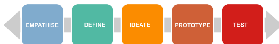
Figure 2: Design Thinking 5 Steps (Adapted from Brown, 2008)

In order to develop an adaptable and/or adoptable model of innovation for use in K-12 education a generic model of DBR (Barab and Squire, 2016) has been applied to iteratively refine this work over the course of three years. Three iterative cycles of refinement were implemented between 2016-2019. This pilot phase of this study process included an initial semester of face-2-face teaching followed by a move to online remote learning. Cycle 2 followed the same pattern however the final cycle was implemented with students without meeting them beforehand. Triangulated data included pre/post-questionnaires, surveys, focus groups, external feedback and student artefacts. In order to ‘map’ onto the DBR methodology described in a way that might prove real-world adaptable, the ‘DESIGN-ED Toolkit’ adapts a contemporary, effective and rapidly iterative design process from industry known as Design Thinking (Brown, 2008; Brenner et al., 2016). Design Thinking is an ever evolving series of iterative action focused on addressing a particular need or well defined problem (Brown and Wyatt, 2010). For ease of access and for the purpose of this paper it is presented here as a linear series of five steps that require constant revision (Figure 2).