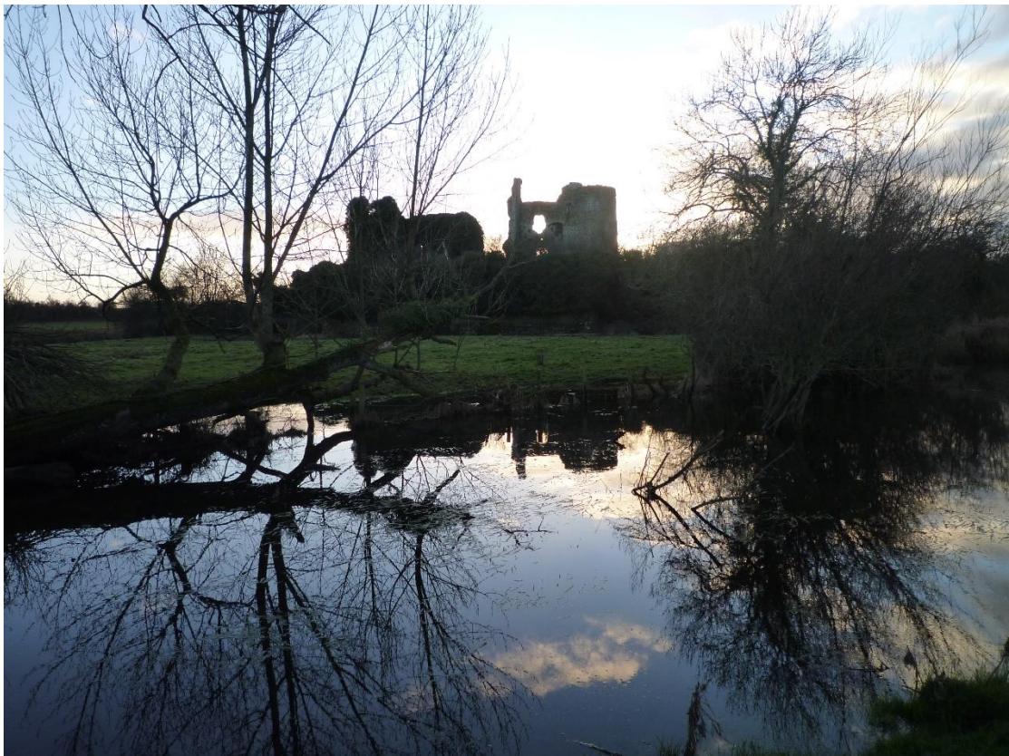
Fig. 3 - Lea Castle, Co. Laois: view across watery landscape facing west-northwest. Photograph Karen Dempsey.

Centrally placed within this landscape, traversing the putative moats and possible fish-ponds, a potential raised route-way may once have given access to and from the castle. Parallel field boundaries, only partially extant today but visible in historic mapping and noted on an antiquarian drawing represent this. Interestingly, it leads east-southeast towards the medieval church. It seems to create a physical link between the church and castle. Indeed, this could be read as a material statement of the ongoing, inseparable dialogue between the sacred and profane in the medieval world. The raised route-way terminates at the putative medieval vill beyond which further east is access to the church lane and medieval church (fig. 2).