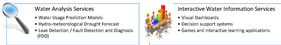
Fig. 2: WATERNOMICS applications

The WATERNOMICS platform forms the basis for the delivery of a number of key services, as outlined in the project objectives: