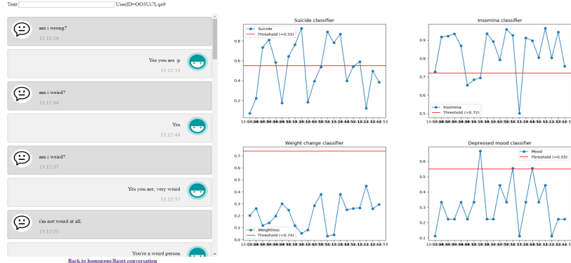
Fig. 3: Demo interface for the conversational system. Graphs are only displayed after 20 iterations.

A demo interface 5 (Figure 3) was developed which combined the conversational model and classifiers. The interface consisted of a text field where users can write a comment which is sent to the conversational model. The reply to this input is shown on the screen to the user after the twentieth interaction the results of the symptom prediction models are shown.