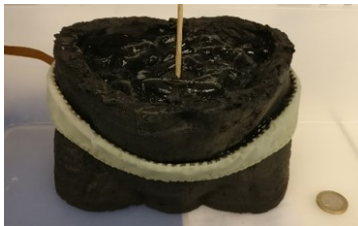
Fig. 2. Image of the pelvic phantom, showing the electrode belt. The bladder is held in the pelvic region by the wooden stick.

For the simulation data set with a SNR of 40dB and the experimental data sets, there was perfect classification across all test runs. For the simulation data set with 20 dB SNR, a confusion matrix is shown in Table 1, showing the mean, and the standard deviation, across the 10 test runs. The table reports the percentage of correctly classified observations (highlighted in green) and the rate of misclassification and to which class the misclassification occurred (shown in yellow and pink).