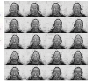
Fig 1: Training image sequence.

AAMs model both texture and geometry by means of principal component analysis (PCA). Due to the fact that PCA cannot differentiate between the various sources of facial variability, e.g. identity, illumination, expression etc., we already focused in our previous research on separating the sources of variability inside the texture space [6]. We proposed there a method for splitting the texture space of an AAM into two orthogonal texture subspaces accounting respectively for identity and illumination variation. The directional lighting model is as well incorporated to increase the robustness to lighting variations, as well as to allow for casting arbitrary shading and shadowing.