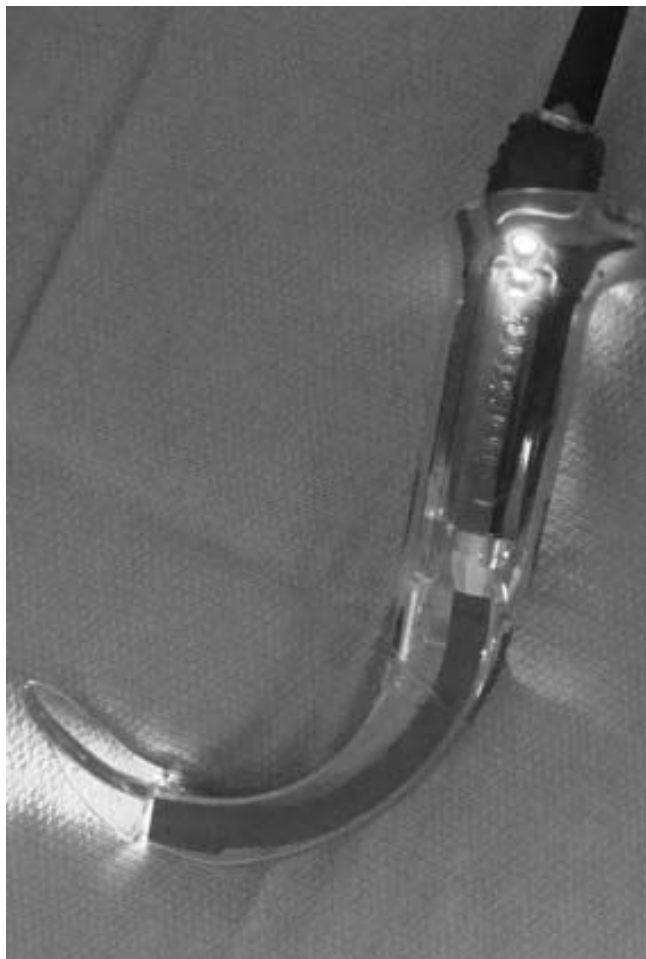
Figure 1 Photograph of the Glidescope laryngoscope. The device is held in the left hand and passed into the mouth over the tongue, and the tip placed in the vallecula or under the epiglottis.

The recent development of a number of indirect laryngoscopes, which do not require alignment of the oral-pharyngeal-tracheal axes, may reduce the difficulty of tracheal intubation in the prehospital setting. Two portable indirect laryngoscopes, which could be included in ambulance equipment inventories, are the Glidescope® (Saturn Biomedical System Inc., Burnaby, Canada) (Figure 1) and the AWS® (Hoya Corporation, Tokyo, Japan) (Figure 2) laryngoscopes. Clinical studies have demonstrated advantages over the Macintosh laryngoscope for both the Glidescope® [6-9], and the AWS® [8,10] laryngoscopes. However, the efficacy of the Glidescope® and the AWS®