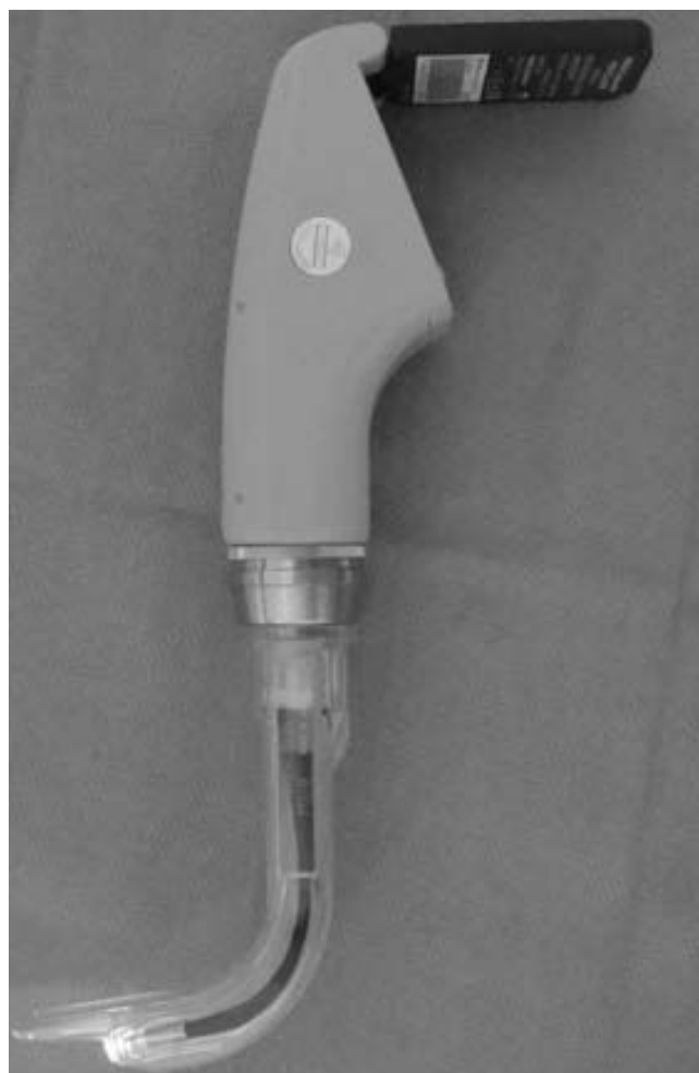
Figure 2 Photograph of the AWS® laryngoscope. The device is held in the left hand and passed into the mouth over the tongue, and the tip is placed under the epiglottis.

when used by APs is not known, and the relative efficacies of these devices in comparison to the Macintosh laryngoscope have not been compared in a single study.