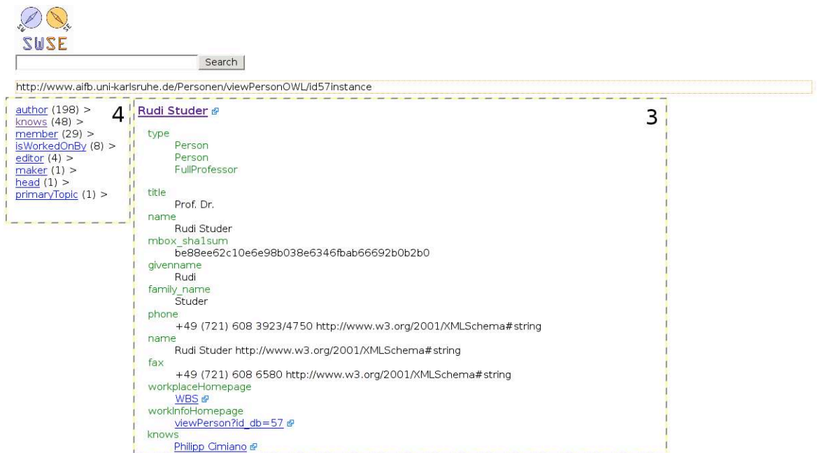
Fig. 2. Entity page containing information about Rudi aggregated from multiple sources.

incoming relations to the focus instance in a column on the left side of the pane (4). Users are shown that Rudi has authored 198 papers, that 48 people know him, that he is the maker of a file and editor of four things.