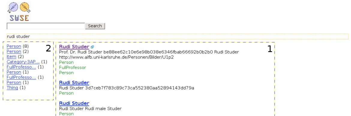
Fig. 1. Results list page after typing in keyword.

and describing not only his personal information (contacts, interests, work environment) but also his surrounding entities (people he knows, his projects, his organisation). Please note that the interface, although demonstrated on browsing a social network, is domain independent and can similarly be used to navigate information spaces in other domains as well.