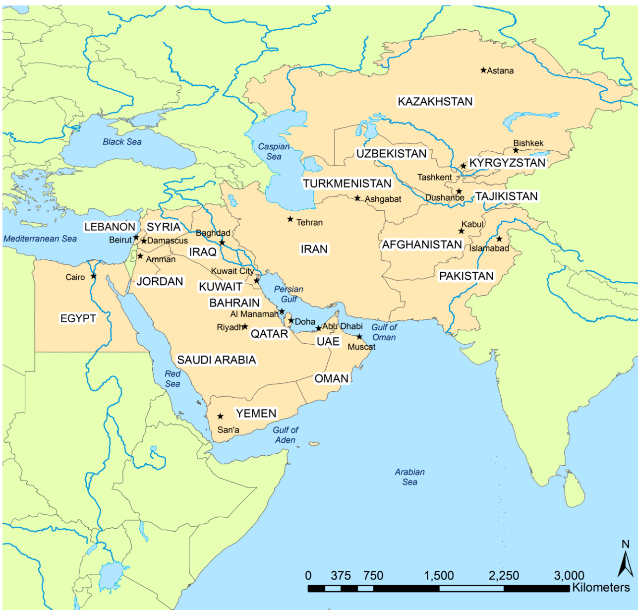
Figure 2: CENTCOM Area of Responsibility, 2010

US grand strategy in the war on terror is chiefly built upon a network of bases in the Middle East and Central Asia, the area militarily managed by the aforementioned US CENTCOM. Its AOR, seen in figure 2, extends from Egypt across the Arabian Gulf to Iraq, Iran and Afghanistan. It calls this vast area the ‘Central Region’ and, at the beginning of 2010, it had over 225,000 armed services personnel forward deployed therein. 41 Historically, the current extent of both CENTCOM forces and bases represents a high point of US geostrategic presence in the region. However, in the early years of the command’s inception in the 1980s, the contemporary scenario could only have been dreamed of by foreign policy strategists in Washington. 42