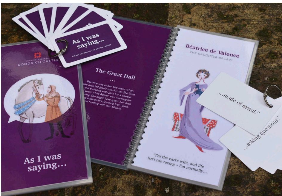
Figure 5. 'As I was saying', interpretation.