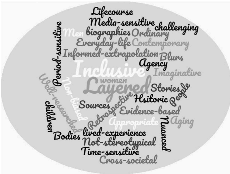
Figure 1. Wordcloud of 'Good' Gender interpretations.

'Including women' also featured prominently. Some groups engaged more directly with current theoretical trends of what 'gender' means, noting the importance of the body, life course and cross-societal approaches.