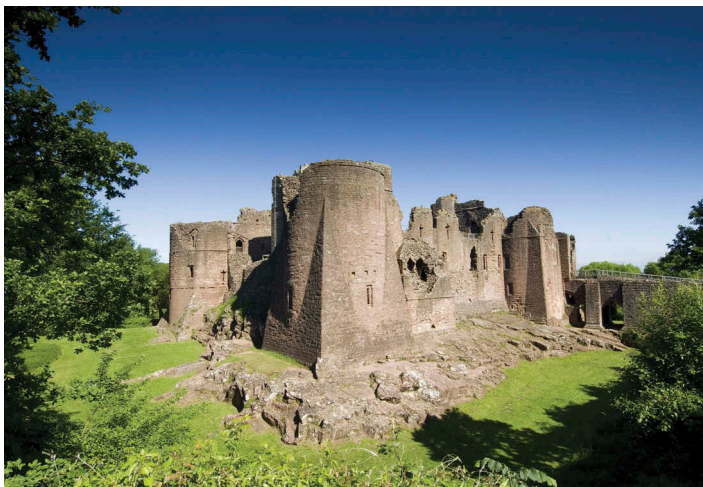
Figure 4. Goodrich Castle, Hereford © Historic England Photo Library.

These extensive buildings are complemented by three remarkable documents, dating to 1295–97: accounts listing the daily household expenditure of Countess Joan de Valence, widowed in May 1296 and now the head of the household (TNA E101/505/25,/26 and/27). The accounts are well-known to social historians and have been mined for information by scholars including Mertes (1988), Woolgar (1999) and most recently Mitchell (2016), author of the only dedicated biography of Countess Joan. The accounts followed a standard formula, listing the outgoings of each household department on every day, and indicating the mistress’s location, with the identities of close relations and guests staying with her. The location clauses show that during the period covered by the accounts, Joan stayed at Goodrich Castle for six months between November 1296 and May 1297, and again in September 1297, when the account ends. Most of these daily entries were concerned with the consumption of foodstuffs, but they contained details of occasional purchases, such as a lantern for the kitchen window, and a canopy for the mistress’s bed. They also provide information about the activities of household members – Philip, a clerk, travelled to Chepstow to buy fish, Thomas the chaplain bought wax at Monmouth. Finally, and most usefully, the accounts also listed at intervals members of an inner core of servants and officials who travelled with the Countess: the chapel clerk, Humfrey of the mistress’s chamber,