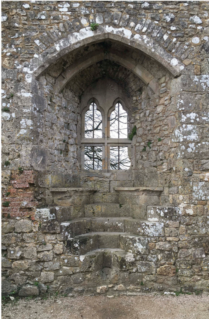
Figure 6. 'Isabella's window' at Carisbrooke Castle © Historic England Photo Library.

(Young 2013). In addition, there is 'Isabella's window'; a visible building element on the visitor route (Figure 6). The naming of this feature can be traced to at least the late nineteenth-century, its good condition can perhaps be attributed to this early assignment and acknowledgement of historical importance. This window opening is located in the north curtain wall and once formed part of Countess Isabella's great chamber. Of the extant buildings and structures of the castle, it is not the only one that can be associated with this period and there are other buildings that could be considered to be more significant, such as the earliest phase of the gatehouse, the great hall and remnants of a chapel. However, in contemporary assessments of value, the level of significance that the window currently enjoys ensures that it is a priority for conservation. It is always presented to the highest standard: clear of vegetation to ensure legibility and structurally stable to ensure longevity. For modern visitors, the window's name is a signifier of a prioritized story and building element. Ultimately, it conveys a message that this element is noteworthy, as is the associated individual. The window provides the visitor with a tangible connection to Isabella's life where they are encouraged to imagine her presence at that particular location, thereby ensuring that her story remains prominent.