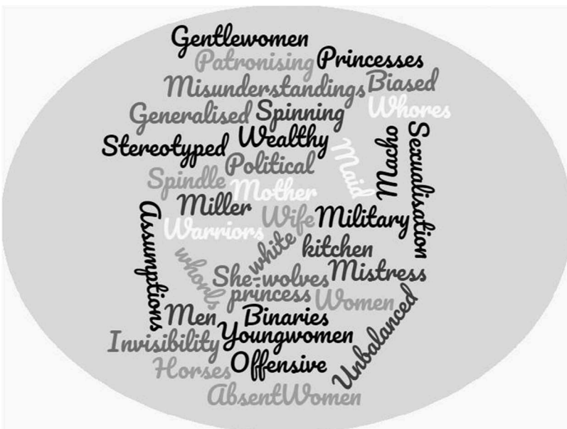
Figure 2. Wordcloud of 'Bad' Gender Interpretations.

Overall, it seems that imagining what 'good' gendered interpretations looked like, proved a lot easier than discussing the 'bad'. There were some differences of opinion around the fairness of listing gendered interpretations as 'bad' because they were simplistic or did not capture the extents of different gender identities. These were viewed as 'a good effort', reminiscent of second wave feminism and the 'add women and stir' approach (Tringham 1991). There was a consensus across all groups that merely including women in a superficial way was a 'bad' interpretation, despite the fact that most groups had defined a 'good' gendered interpretation as 'including women' (Figures 1 and 2). The results of this breakout