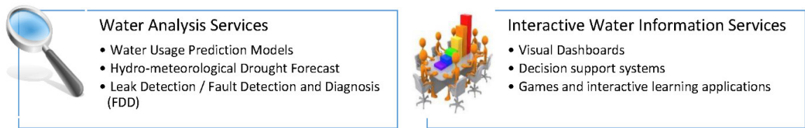
Fig. 2: WATERNOMICS applications

The WATERNOMICS platform forms the basis for the delivery of a number of key services, as outlined in the project objectives: